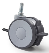
WHEELS WITH BRAKE Easy access for cleaning

The Lemi Podo 5 chairs can be customised with a choice of accessories.