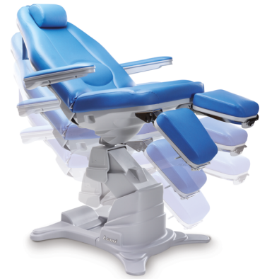
ELECTRIC HEIGHT ADJUSTMENT