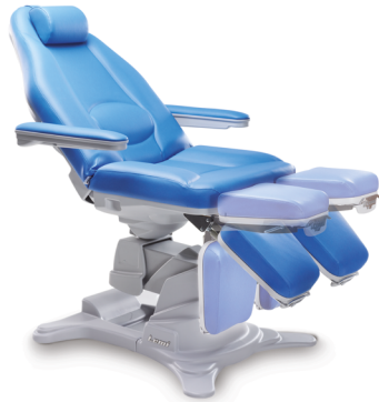
ADJUSTABLE LEG SUPPORTS