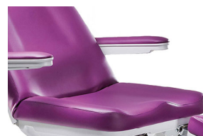
SEAM FREE UPHOLSTERY