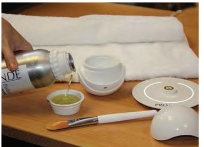
Step 6: Add oil to cup