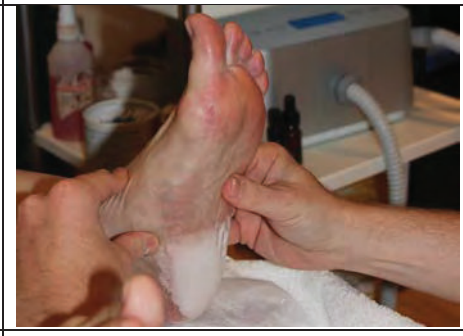
Step 14: Gently massage and loosen