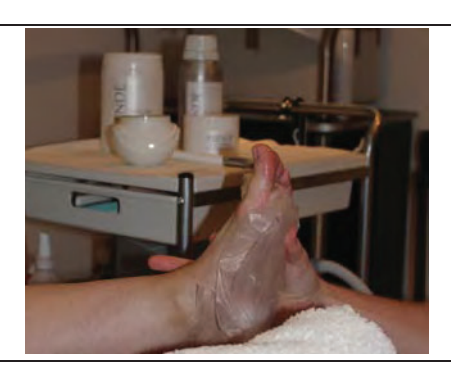
Step 12: Cover foot with plastic sheet