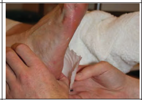
Step 15: Remove all wax