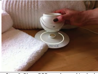
Step 3: Place ORB on plugged in dock