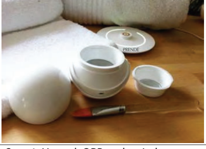
Step 1: Unpack ORB and switch on