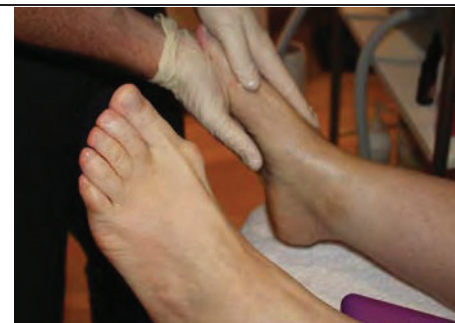
Step 16: Massage in Ureka Footcare Cream