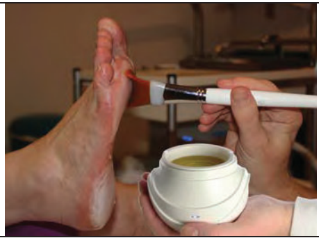
Step 10: Brush REALLY SLOWLY