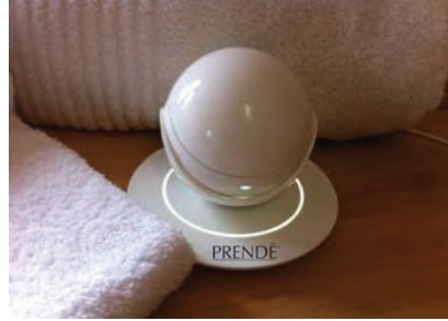
Step 5: Wait until light turns solid (20-25 min)