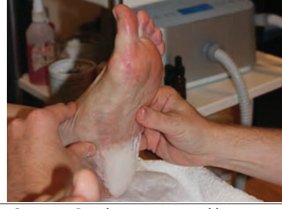
Step 13: Gently massage and loosen