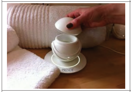
Step 4: Put on lid